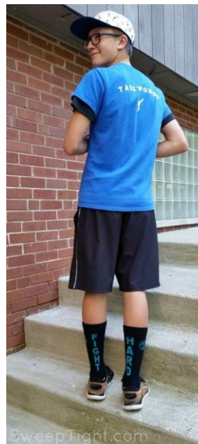
Shorts, t-shirt, ball cap