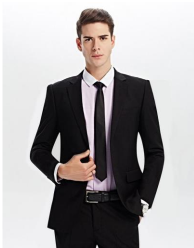
Shirt and Tie, Dress pants