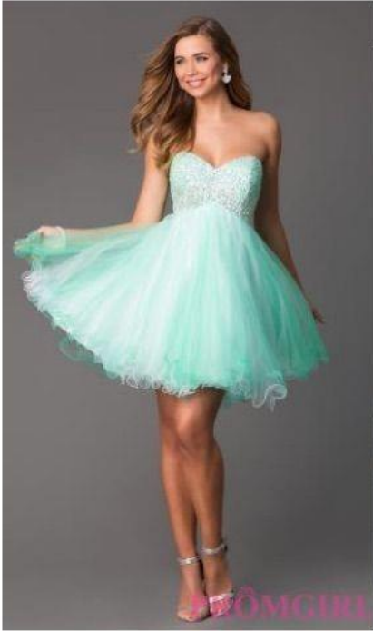
Modest shorter length