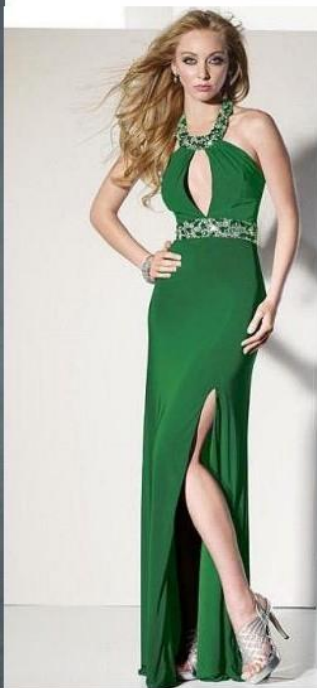
Keyhole too low