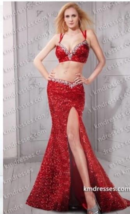
Midriff too revealing and opening by leg to high